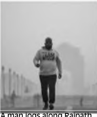
A man jogs along Rajpath near India Gate under heavy smog conditions in New Delhi on Tuesday.

Pakistan target BoPs: Pakistani Rangers overnight targeted border out posts (BoPs) and villages along the International Border in Kathua and Kashmir in violation of the ceasefire agreement, drawing strong retaliation from the BSF, officials said on Tuesday. There was no report of any casualty or damage on the Indian side.