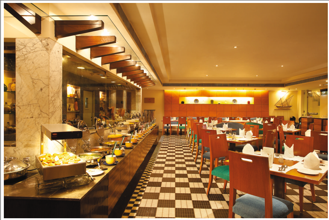
Welcomcafe Cambay 24x7 Fine Dining restaurant