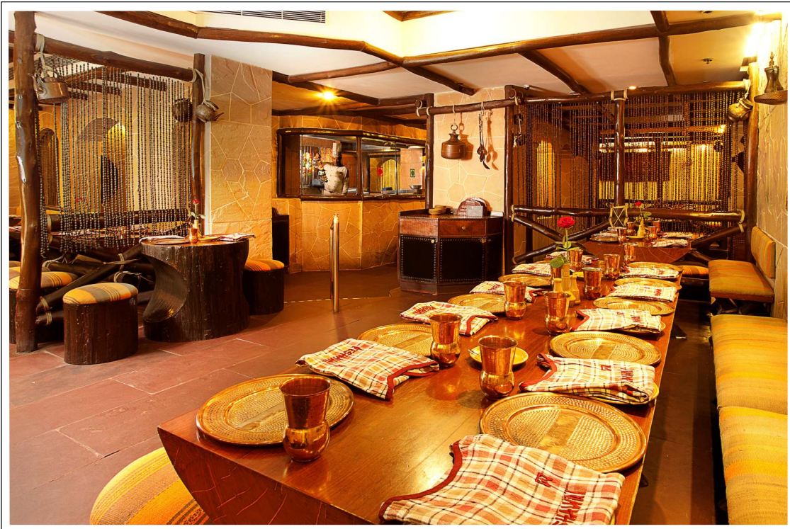
Peshawri - Speciality restaurant offering North-West Frontier cuisine