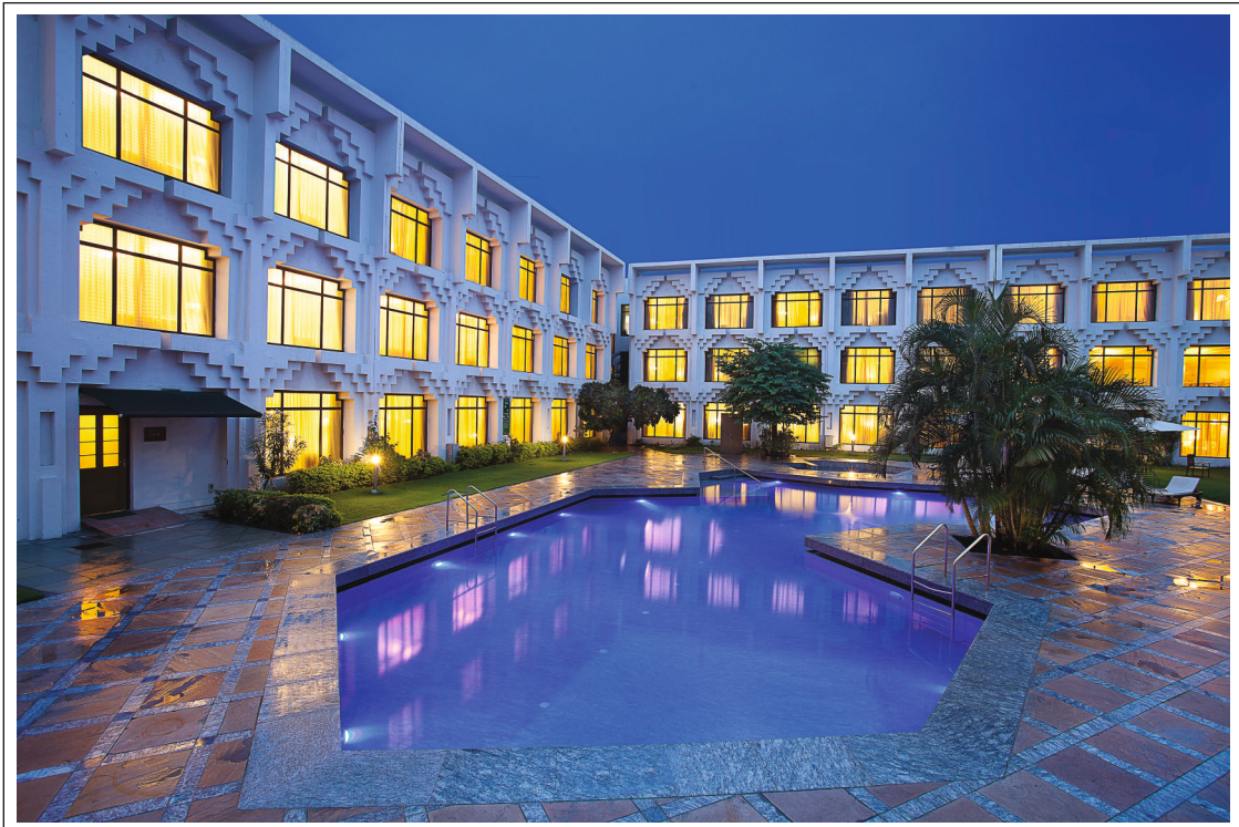
Pool Side View