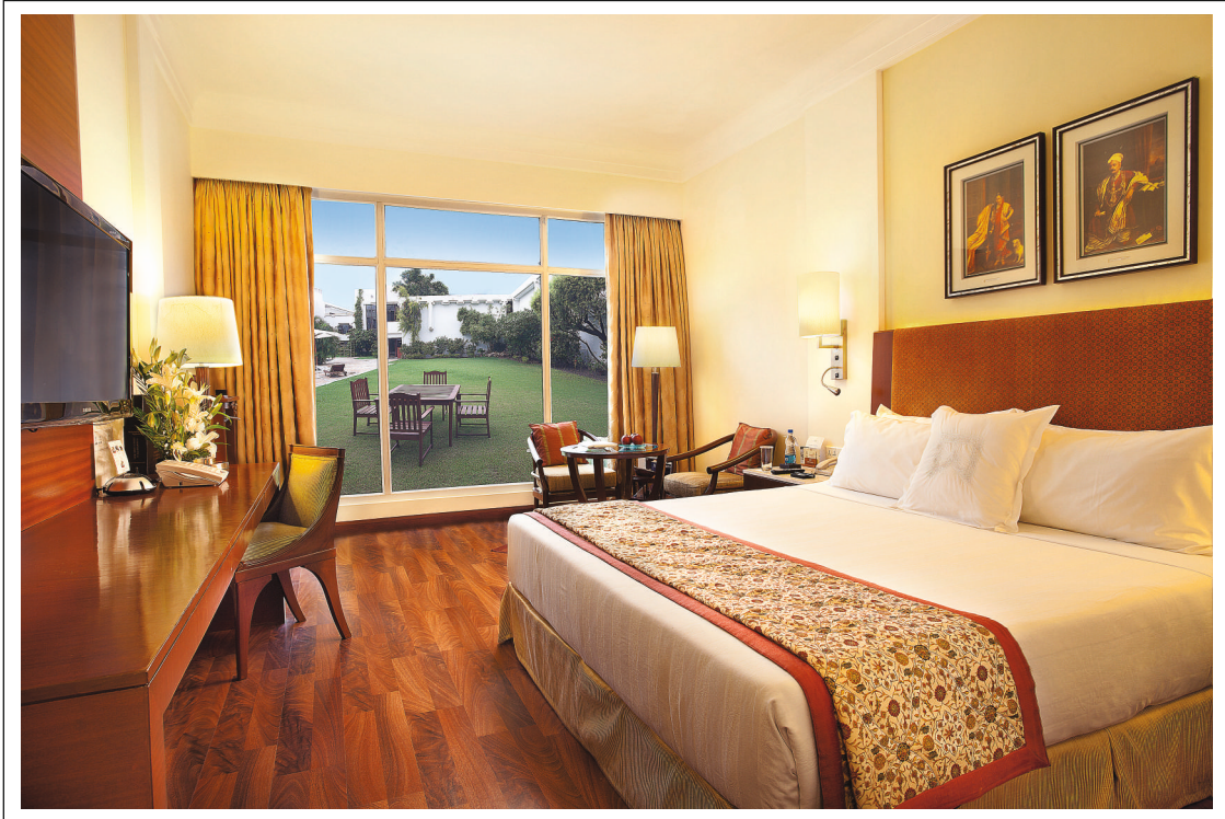
Executive Club Exclusive room