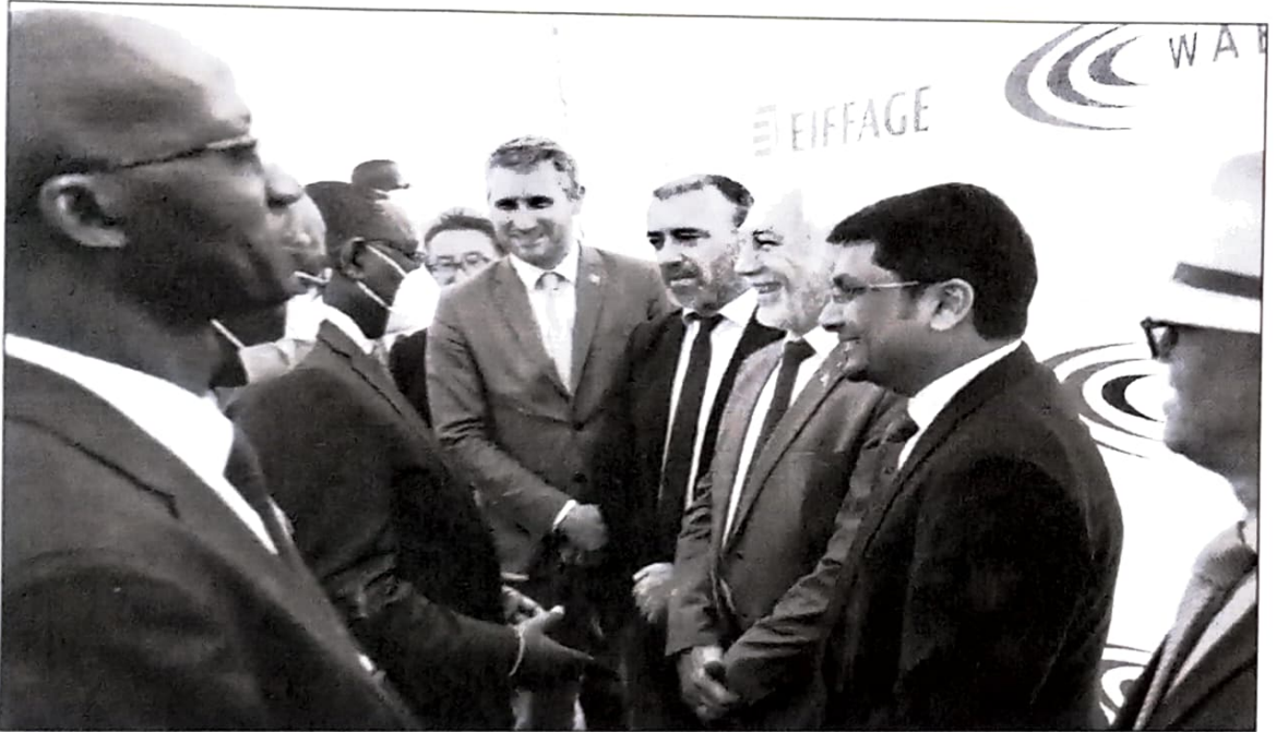
President of the Republic of Senegal interacting with the consortium representatives, during the ground breaking ceremony

This breakthrough order in the West African region, marks the entry of WABAG into a new geography, Senegal. WABAG is already executing 50 MLD ( expandable to 100 MLD ) Desalination project in Tunisia, North Africa being funded by KfW Germany. This order further consolidates WABAG's business in the African continent.