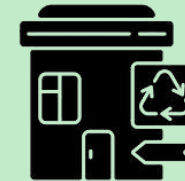
Regional Collection Centres