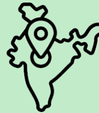
PAN India Network

In our efforts to be at the forefront of transforming the plastic waste management industry by organizing the unorganized waste supply chain. With a future-ready approach and strategic initiatives, RACE is making significant strides in sustainability and efficiency.