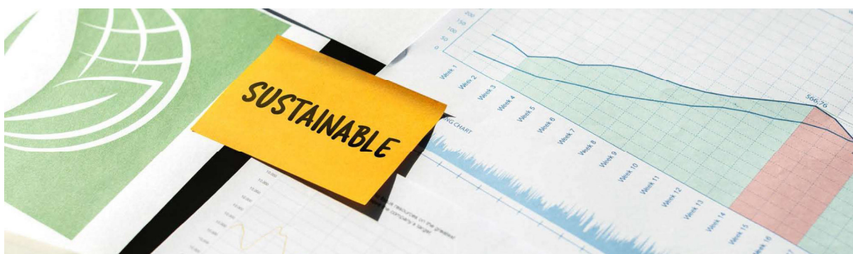
Annexure II to the Board's Report

The disclosure under this report are made on a standalone basis.