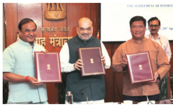
(From left) Assam Chief Minister Himanta Biswa Sarma, Union Home Minister Amit Shah, and Arunachal Pradesh CM Pema Khandu, in New Delhi on Thursday

Assam and Arunachal Pradesh share an 804.1-km-long border. The two states have been in discussions to resolve the border dispute with Sarma and Khandu signing the Namsai Declaration on July 15 last year wherein they had pledged to find a solution