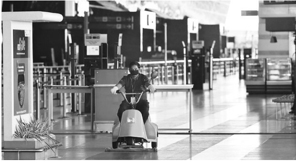
A worker cleans inside IGI Airport premises on Friday