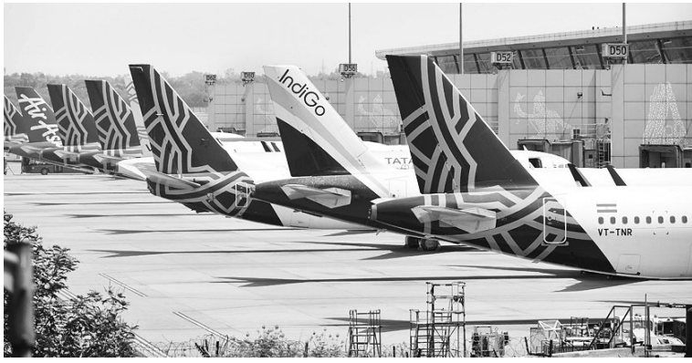
Aeroplanes parked at IGI Airport, New Delhi, on Friday

Both aggregators said they witnessed a 10x increase in searches and bookings