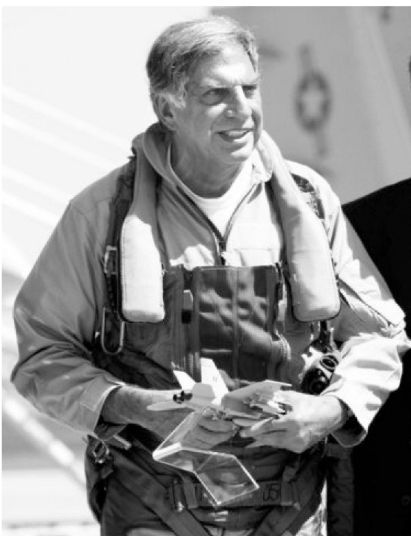
Ratan Tata after flying the US F-18 aircraft as a co-pilot during the Aero India 2007 air show in Bengaluru

When India began to allow private airlines in the early 1990s, Tata's interest was piqued again. In 1994, the group came up with an ambitious plan to start an airline with 100 planes in partnership with Singapore Airlines, but