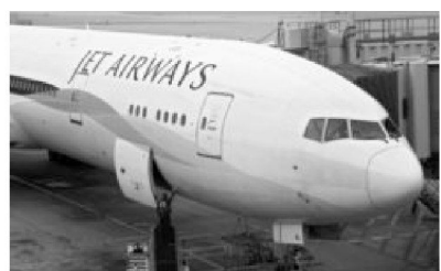
MAY START FLYING IN SUMMER OF 2021

approved the airline's revival plan submitted by the consortium in October. Jet was grounded on April 17 due to liquidity crisis and subsequently went into administration in June 2019.