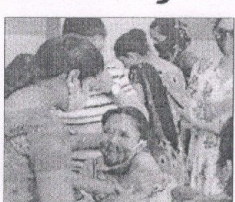
start to the new phase of universal vaccination on June 21, when a record 87 lakh doses were administered. It was then that the target of 13.5 crore doses for July was announced. Official data shows that the weekly doses administered had come down from a high of 4.5 crore in the week ending June 26 to 2.8 crore in the week ending

New Delhi, Agency. India recorded 29,639 new cases of the novel coronavirus, along with 415 deaths in the past 24 hours. The daily case-load is less than 30,000 after 132 days. Kerala and Maharashtra reported 11,586 new cases and 4,677 infections, respectively. The active cases, currently at 3,98,100, dropped below 4 lakh for the first time since March 24. As of Monday, there were 3.96 lakh active cases in the country, of which 1.37 lakh infections are from Kerala. In other news, India is likely to miss its vaccination target of 13.5 crore doses for July if the current pace, India would end up administering about 12.5 crore doses by the end of July. To meet the target of 13.5 crore doses per day, a number that has been attained only twice this month. The pace of Covid-19 vaccination has slowed down considerably in July, after a booming