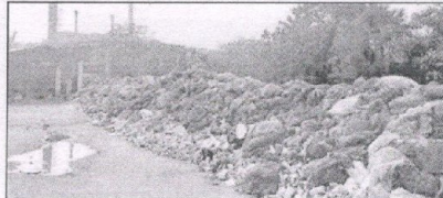
Government has assessed the increase in e-waste in the country during 2017-18, 2018-19 and 2019-20. The formula for estimation of e-waste generation involves the sale of EEE. Scrutiny of sales data reveals that there have been continuous increases in the sales data since 2007-08 and hence there is an increase in e-waste generation. The minister said that no deaths related to e-waste have been reported in the country so far and pointed out the

Chandigarh, Agency. India generated 10,14,961.2 tonnes of e-waste last year, a massive 31.6 per cent increase from the previous year, Minister of State for Environment, Forests and Climate Change, Ashwini Kumar Choubey informed the Rajya Sabha on Monday. Choubey was responding to a question placed before the House by MP Moresh Singh. He asked for details on the e-waste generated in the past three years. He also asked for state-wise data and a report on deaths, if any, that had resulted from e-waste. The minister informed Parliament that data regarding e-waste is only available in the country from 2017-18 onwards that too only National data. The e-Waste (Management) Rules were notified in 2016 which got amended from time to time. So far, the Environment Ministry has notified 21 types of electrical and electronic equipment (EEE) as e-waste. In 2017-18, India generated 7,08,445 tonnes of e-waste and 7,71,215 tonnes in 2018-19 - an increase of 0.86 per cent. Accepting the steady rise in the production of e-waste in the country, Choubey said, "The