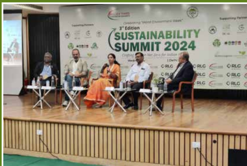
Sustainability summit 2024