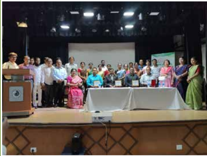
Workshop West Bengal 2023