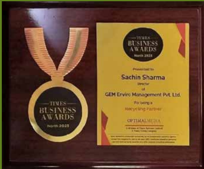
Times Business Awards North 2023 For being a Recycling Partner