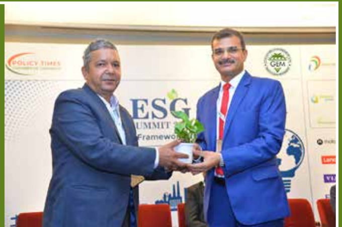
ESG Summit 2024