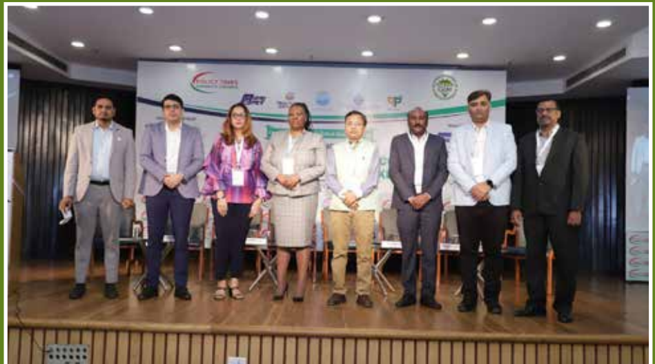
Global recycling day Conference on EPR