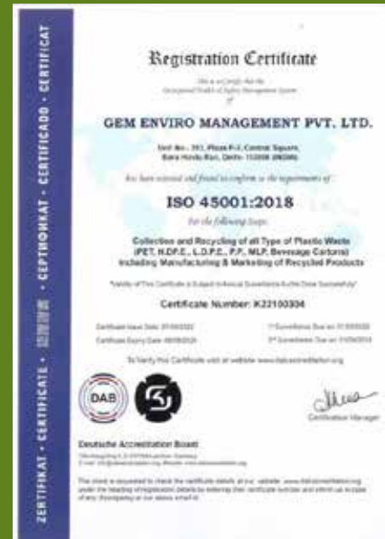
ISO 45001:2018 Certificate From Deutsche Accreditation Board