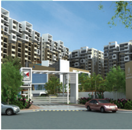
Manjeera Monarch, Vijayawada Project