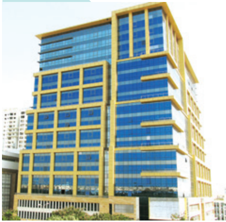
MANJEERA TRINITY CORPORATE