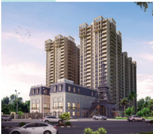
Manjeera French County Vijayawada Project