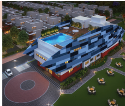
Manjeera Blue Ongole Project