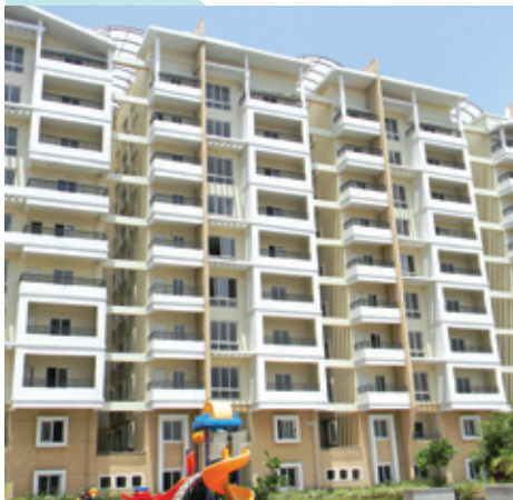
MANJEERA DIAMOND TOWERS