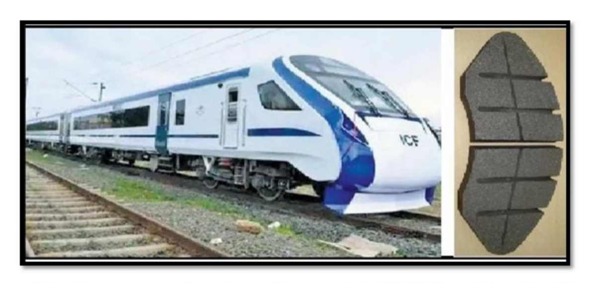
Our indigenously developed LHB Disc Brake Pad for high-speed trains