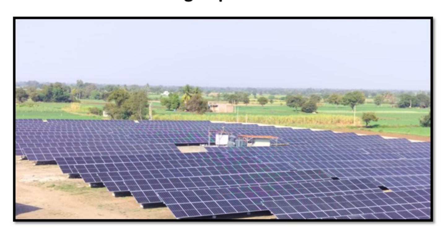
Solar installation at our Paithan plant.