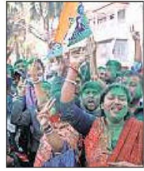
TMC supporters celebrate in Bidhannagar.

THE RULING Trinamool Congress on Monday registered a landslide victory in the February 12 civic polls in West Bengal, winning all four municipal corporations. The BJP, which emerged as the main opposition party in the Assembly polls last year, has been pushed to the third position in terms of vote share while the Left Front ended up as a distant second. In all four civic bodies - Asansol, Bidhannagar, Chandannagar and Siliguri - combined, the TMC received 61 per cent vote share while the BJP got 14.5 per cent vote share. The Left Front, which failed to