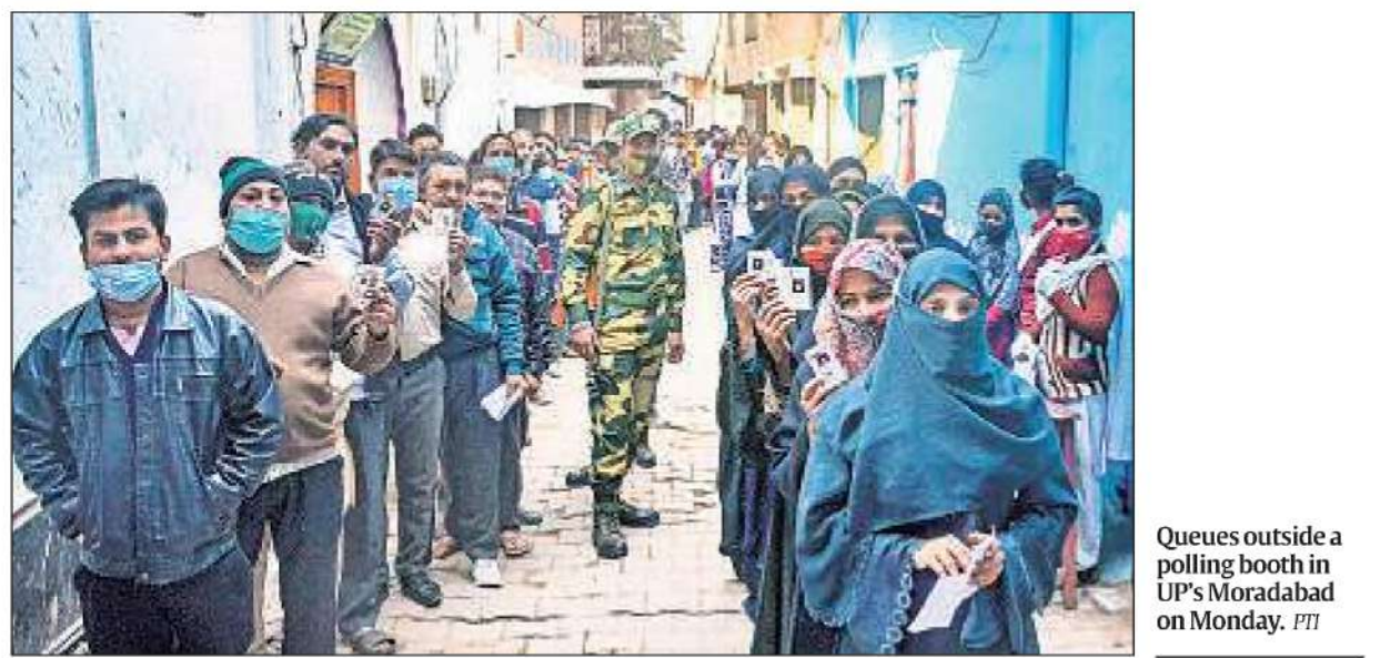
Queues outside a polling booth in UP's Moradabad on Monday.