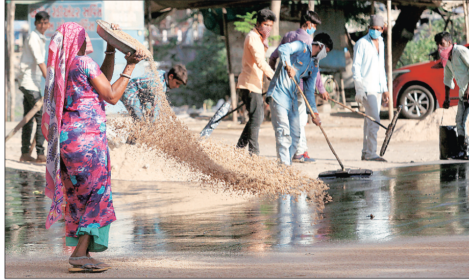
Road carpeting work under way in Vadodara on Tuesday.

"This year too, we are expecting a similar income. We also have another major source of income through town planning and we