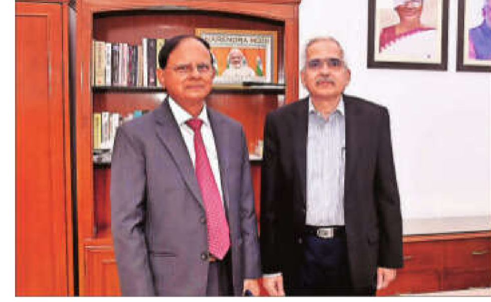
Shaktikanta Das (right) with principal secretary PK Mishra as the former e assumes charge as principal secretary-2 to the Prime Minister, in New Delhi on Monday

Das' high-profile posting came barely two months after his six-year stint as the Reserve Bank of India (RBI) governor. He will work along with principal secretary PK Mishra, a retired IAS officer of the Gujarat cadre