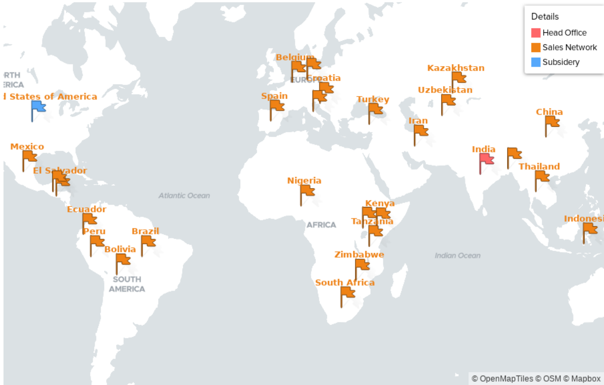
MEERA Export Presence Worldwide

This is for your information and record please.