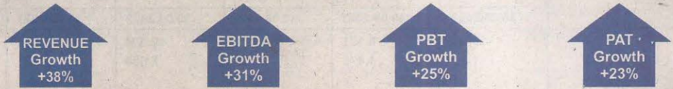
Figure above depicts consolidated result Q2, FY22-23 in comparison with Q2, FY21-22

Extract of Unaudited Financial Results for the Quarter & Half Year Ended September 30, 2022