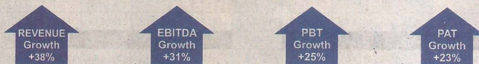
Figure above depicts consolidated result Q2, FY22-23 in comparison with Q2, FY21-22

Extract of Unaudited Financial Results for the Quarter & Half Year Ended September 30, 2022