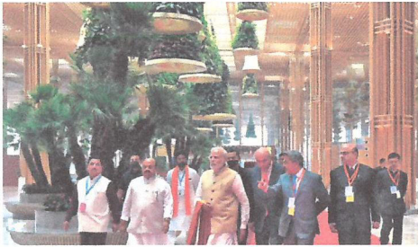
PM Modi at the inauguration of T2, Bengaluru Airport, on Friday

After Prime Minister Narendra Modi's inauguration of Bengaluru Airport's Terminal 2 on Friday, the region's busiest airport joined the ranks of Hamad International Airport in Doha and the Changi Airport in Singapore, which boast gardens and lush greens inside their terminals. "Sustainability and wellness have been critical considerations at each stage of the design process," said Skidmore, Owings & Merrill (SOM), the Chicago-headquartered architectural and urban planning firm that has designed Bengaluru airport's new terminal. The building's extensive outdoor areas were designed in an effort to maximise wellness prior to the Covid-19 pandemic; today, the wisdom of integrating generous outdoor spaces into an airport terminal and transportation hub is even more evident. Built at a cost of around ₹5,000 crore, the T2 will handle 25 million passengers annually.