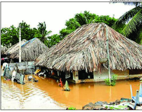
Flood water at Edurubidim village in East Godavari district of Andhra Pradesh on Monday

The report also informed that the water level at the Bhadrachalam district of Telangana is steady but may increase gradually and reach 1st warning level by the evening of August 5. According to the report,