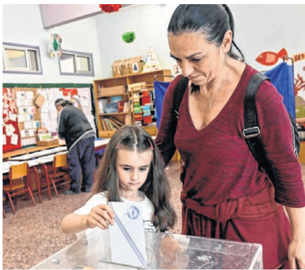
A child casts the ballot of her mother at a polling station on the general elections in Athens on Sunday

Although Mitsotakis has been steadily ahead in opinion polls, a newly introduced electoral system of proportional representation makes it unlikely that whoever wins the election will be able to garner enough seats in Greece's 300-member parliament to form a government without seeking coalition partners.