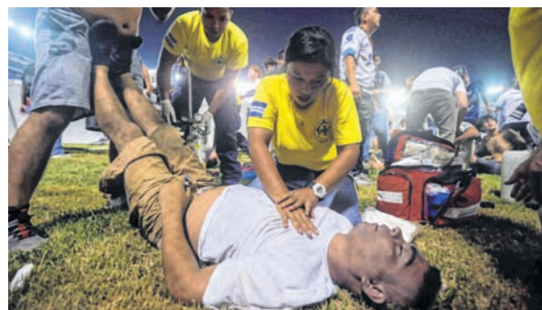
Rescuers attend an injured man lying on the pitch following a stampede during a football match between Alianza and FAS at Cuscatlan stadium in San Salvador