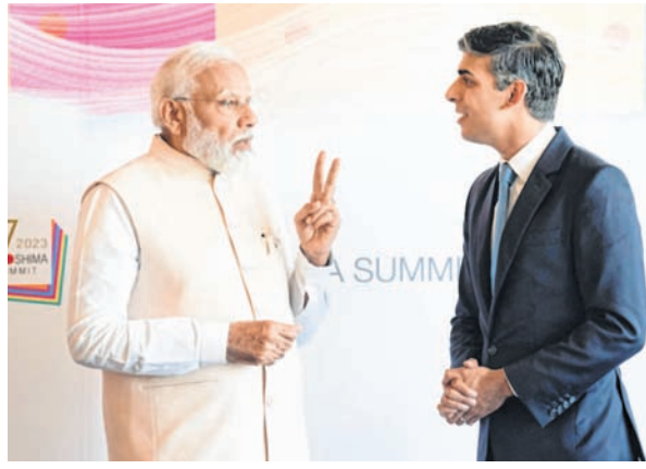
Prime Minister Narendra Modi (left) meets with Britain's Prime Minister Rishi Sunak during the G7 Leaders' Summit in Hiroshima on Sunday

They agreed to deepen co-operation across a wide range of areas, such as trade & investment, science & technology, higher education, and people-to-people relationship,