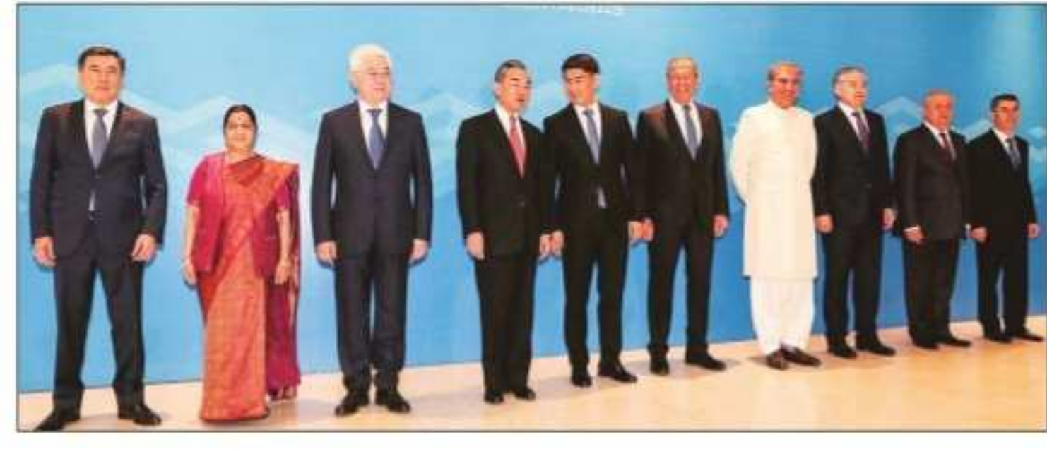
External Affairs Minister Sushma Swaraj with other leaders, including Pakistan's Shah Mahmood Qureshi, at the SCO meet, in Bishkek, Kyrgyzstan on Wednesday.

In spite of a turbulent global scenario, SCO member states