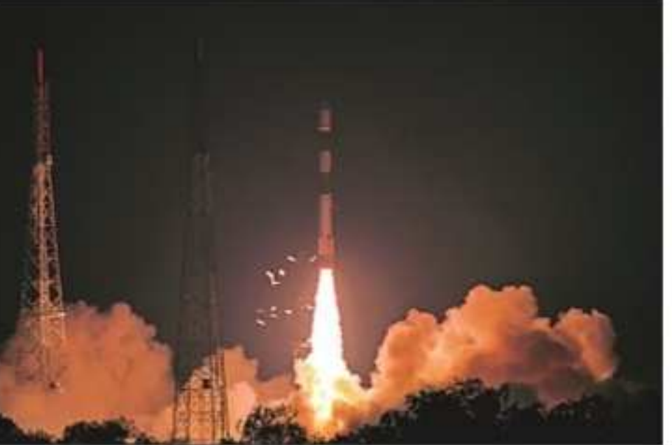
ISRO's PSLV-C46 carrying the RISAT-2B observation lifts off from Sriharikota in Nellore district on Wednesday.

Very much like the flashlights of the camera, which release visible light to illuminate an object and then use the reflected light to create an image, the synthetic aperture radar send out hundreds of radio signals every second towards the subject (in this case, the earth) and capture the reflected signals to create a radio image, which can then be used by computers