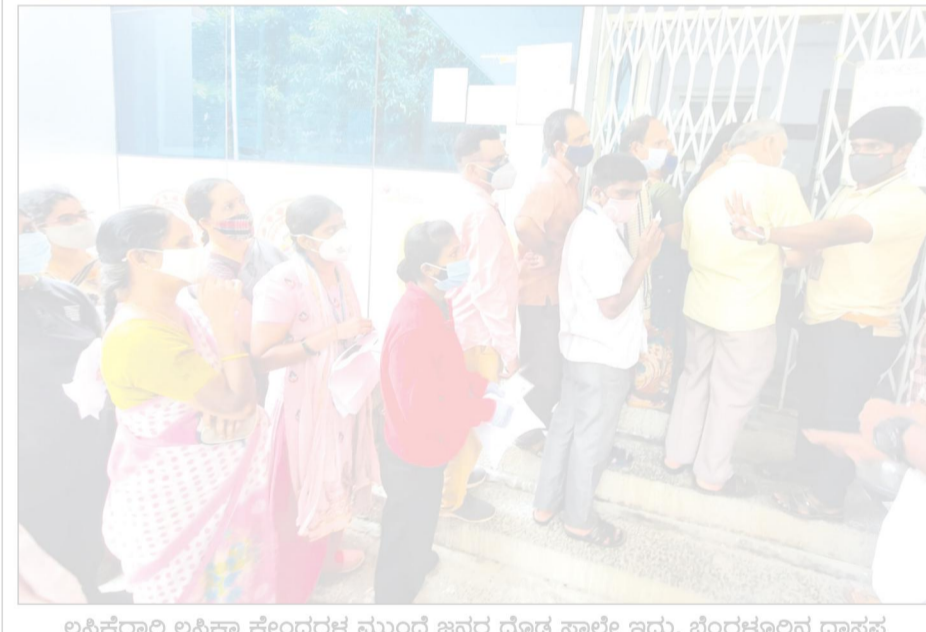
ಲಿಕೆಗಾರಿ ಲಿಕೆಕಾ ಕೇಂದ್ರಗಳ ಮುಂದೆ ಜನರ ದೊಡ್ಡ ಸಾಲೇ ಇದ್ದು, ಬೆಂಗಳೂರಿನ ದಾಸಪ್ಪ ಆಸ್ಪತ್ರೆಯಲ್ಲಿ ಲಿಕೆಗಾರಿ ಜನ ಸರದಿ ಸಾಕವಣ್ಣು ನಿಂತಿರುವುದು.