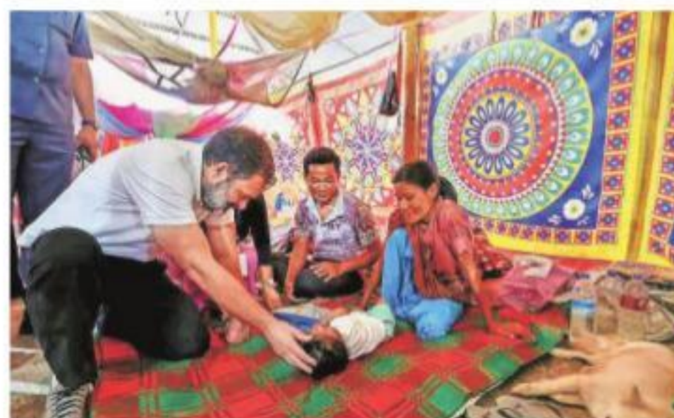
Congress leader Rahul Gandhi comforts a child at a relief camp in Moirang, Manipur, on Friday

Among the reasons analysed by the security establishment is lack of proper coordination among various forces and the vastness of the topography to be covered. While the