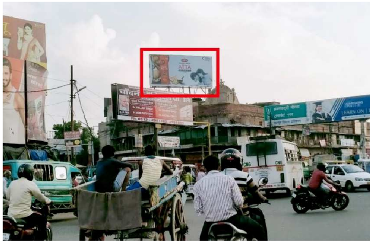
Railway Station Circle Kailash Building Rooftop Size 30x15ft