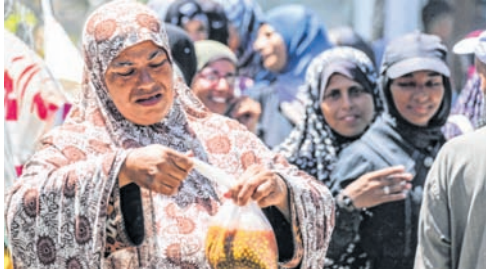
A woman knots a bag of pea stew, while others await their turn to collect food from a public kitchen in Deir el-Balah in the central Gaza Strip on Monday

"On the one hand, they're saying too many Palestinian civilians have been killed. With the other hand, they're depriving us of the precision-guided weapons that actually cut down on civilian casualties," Republican Senator JD Vance of Ohio told CNN though Biden specifically mentioned withholding bombs and artillery shells deemed by the administra-