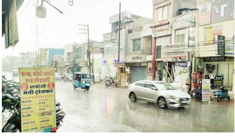
हल्की बूंदाबांदी के साथ 40 से 50 डे प्रतिघंटे की रफ्तार से आंधी चल सकती है। 24 घंटों में 1 डिग्री गिरा तापमान-मौसम का मिजाज 24 घंटों में फिर बदल गया। रविवार को दिन का तापमान 39.1 (-1) डिग्री सेल्सियस रिकॉर्ड किया गया था।

नगर प्रतिनिधि इंदौर। इंदौर में वोटिंग डे पर बारिश के साथ चने के आकार से भी बड़े ओले गिरे। शाम चार बजे बायपास, अन्नपूर्णा सहित कई इलाकों में तेज बौछारें गिरीं। वोटिंग समाप्त होने से ठीक पहले बारिश होने से मतदान प्रभावित हो गया। घरों से लोग नहीं निकल पाए। इसका असर मतदान प्रतिशत पर हो सकता है क्योंकि गर्मी के कारण दोपहर में मतदान कम हुआ था। उम्मीद थी कि शाम के वक्त मतदान तेजी से बढ़ेगा लेकिन उसी बीच बारिश हो गई। इंदौर लोकसभा में दोपहर 3 बजे तक आठ घंटे में 48.04% मतदान हुआ था, जो पिछली बार से भी कम है।