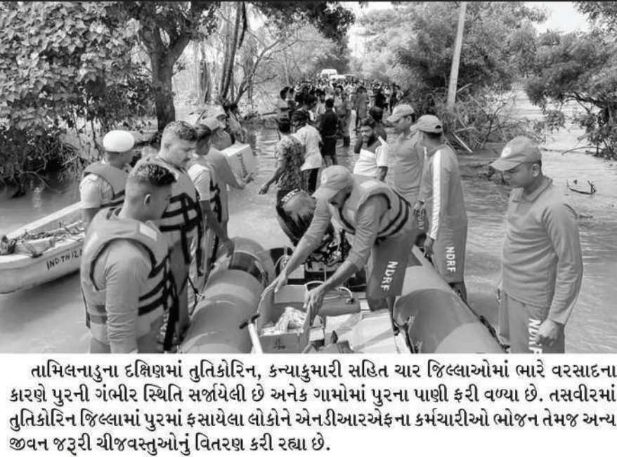
તામિલનાડુના દક્ષિણમાં તુતિકોરિન, કન્યાકુમારી સહિત ચાર જિલ્લાઓમાં ભારે વરસાદના કારણે પુરની ગંભીર સ્થિતિ સર્જાયેલી છે અનેક ગામોમાં પુરના પાણી ફરી વળ્યા છે. તસવીરમાં તુતિકોરિન જિલ્લામાં પુરમાં ફસાયેલા લોકોને એનડીઆરએફના કર્મચારીઓ ભોજન તેમજ અન્ય જીવન ચીજવસ્તુઓનું વિતરણ કરી રહ્યા છે.