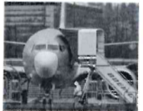
which was not a part of previous 737 models. The 737 Max returned to the skies in the United States last month, after the Federal Aviation Administration approved changes that Boeing made to the automated flight control system. It has also been allowed by Brazil to resume flights, and Transport Canada said earlier this week that it had been cleared to start flying again Wednesday.