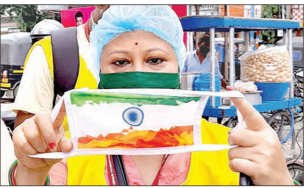
তেরঙ্গা মাস্ক বিক্রি বন্ধ পথে স্বেচ্ছাসেবীরা।