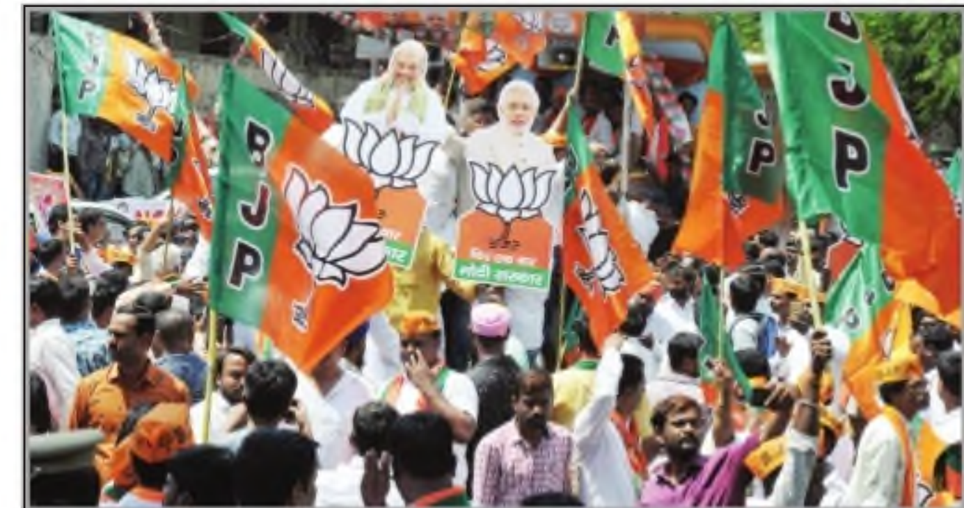
BJP supporters celebrate as BJP wins four MP seats in Telangana, Hyderabad, on Friday.