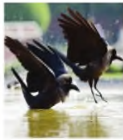
Crows in a lily pool on a hot afternoon, in the Capital on Friday.