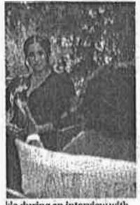
kle during an interview with

help through the palace's human resources department, but was told there was nothing they could do. Meghan said she grew concerned about her son not having a royal title because it meant he wouldn't be provided security. Meghan said digesting everything during while pregnant was "very hard". More than the "prince" title, she was the most concerned about her son's safety and protection.