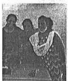
वारी केरू कापताना महिला.

याबाबतची माहिती घेण्यासाठी संपर्क साधावा. याबाबतची माहिती घेण्यासाठी संपर्क साधावा. याबाबतची माहिती घेण्यासाठी संपर्क साधावा.