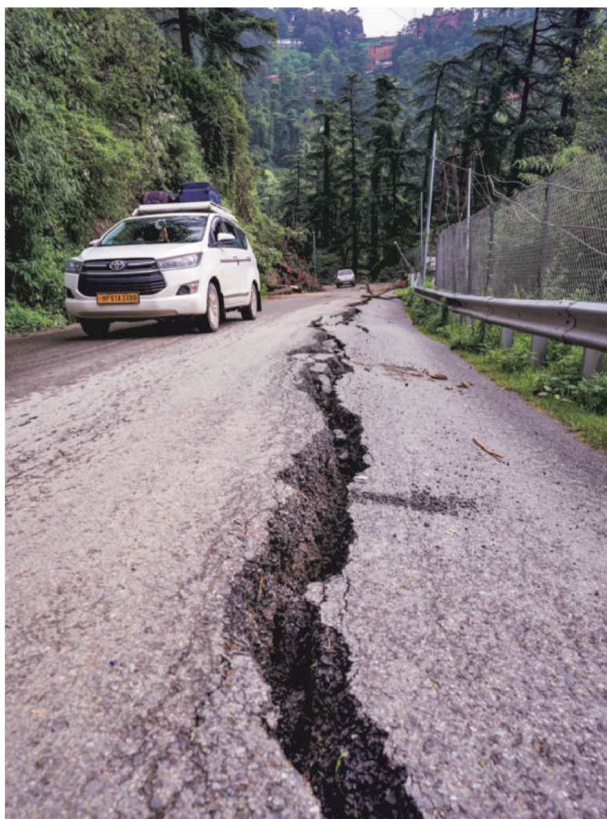
Cracks appear on a road after heavy rainfall in Shimla on Tuesday