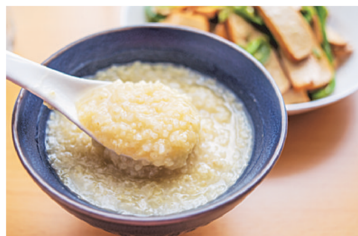
At The Claridges, millet will be a highlight on the menu as India celebrates 2023 as the year of millets