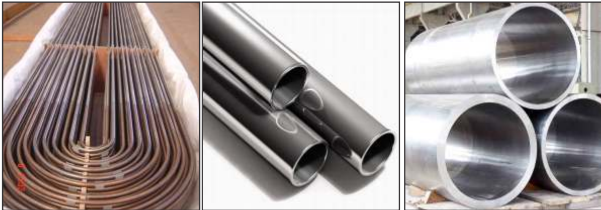
Stainless Steel Welded and Seamless Pipes & Tubes