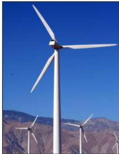
Wind Power Promoting Green Energy