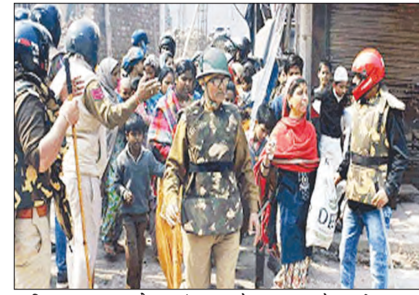
सुरक्षित महसूस कर सके, जहां डर और भय का माहौल न हो।

साथ बाहर जाते हुए लोग देखे गए। मंगलवार दोपहर कबीर नगर में पत्थरबाजी हो रही थी। अद्वैत बल ने मोर्चा संभाला हुआ था, तभी यमुना विहार से कुछ लोग बैग लेकर पुलिस के पास पहुंचे और परिवार सीलमपुर तक पहुंचाने की गुहार लगाई। पुलिस पत्थरबाजों से निपटने में लगी हुई थी। परिवार के सदस्यों के चेहरे पर खोफ साफ देखने को मिल रहा था, महिलाओं ने बच्चों को सीने से लगाया हुआ था। इस बीच एक परिवार ने बातचीत में बताया कि वह ऐसी जगह जा रहे हैं, जहां खुद को सुरक्षित महसूस कर सके, जहां डर और भय का माहौल न हो।