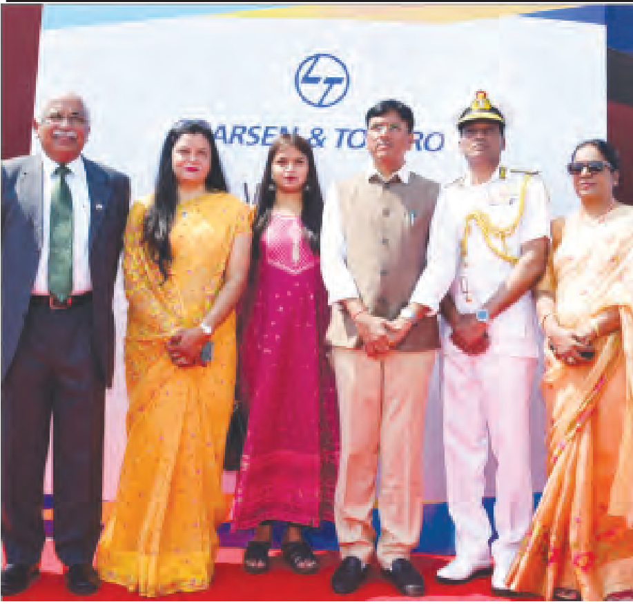
जहाजराजी राज्य मंत्री (स्वतंत्र प्रभार) और रसायन एवं उर्वरक, श्री मनसुख एल. मंडाविया, एल एंड टी शिपबिल्डिंग लिमिटेड, कटपुल्ली, चेन्नई में 6 वें तटरक्षक अपतटीय गश्ती पोत (ओपीवी) रा ब्रज के शुभारंभ समारोह में।