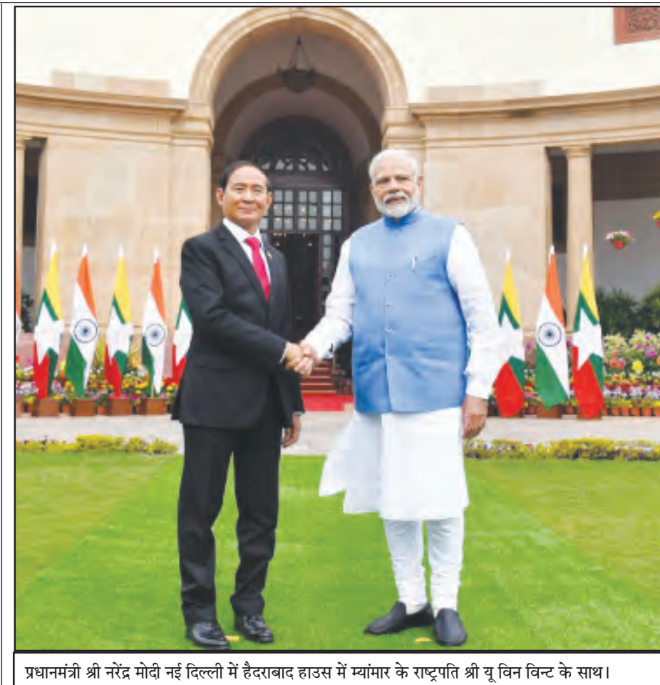
प्रधानमंत्री श्री नरेंद्र मोदी नई दिल्ली में हैदराबाद हाउस में म्यांमार के राष्ट्रपति श्री यू विन विन्ट के साथ।