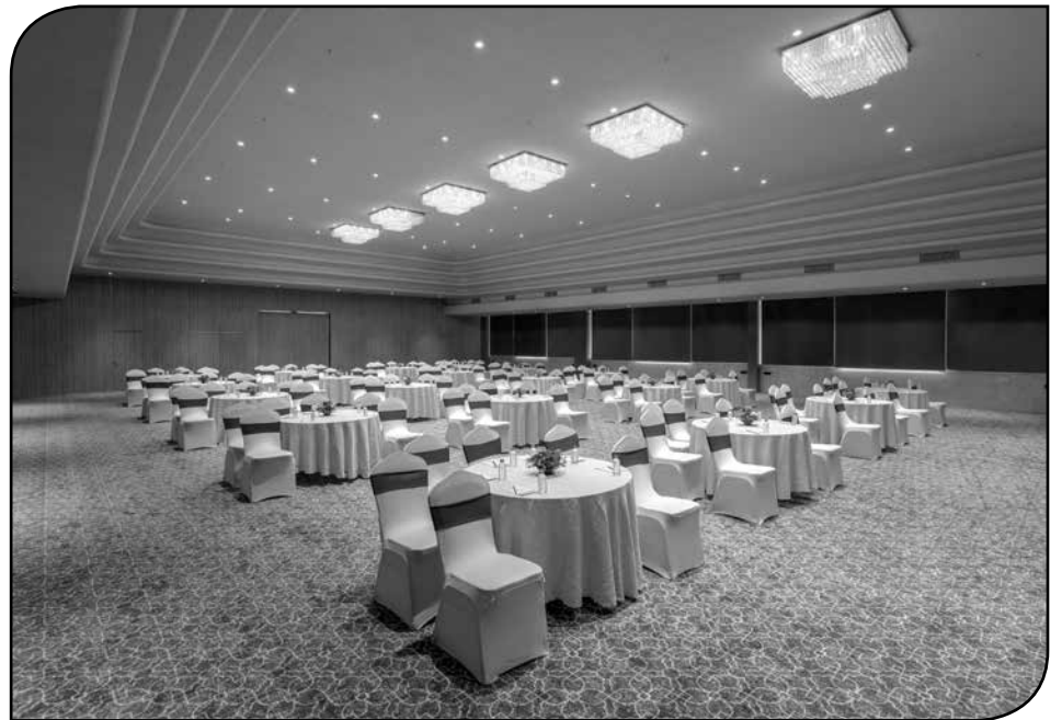
SAMMROH - BALLROOM