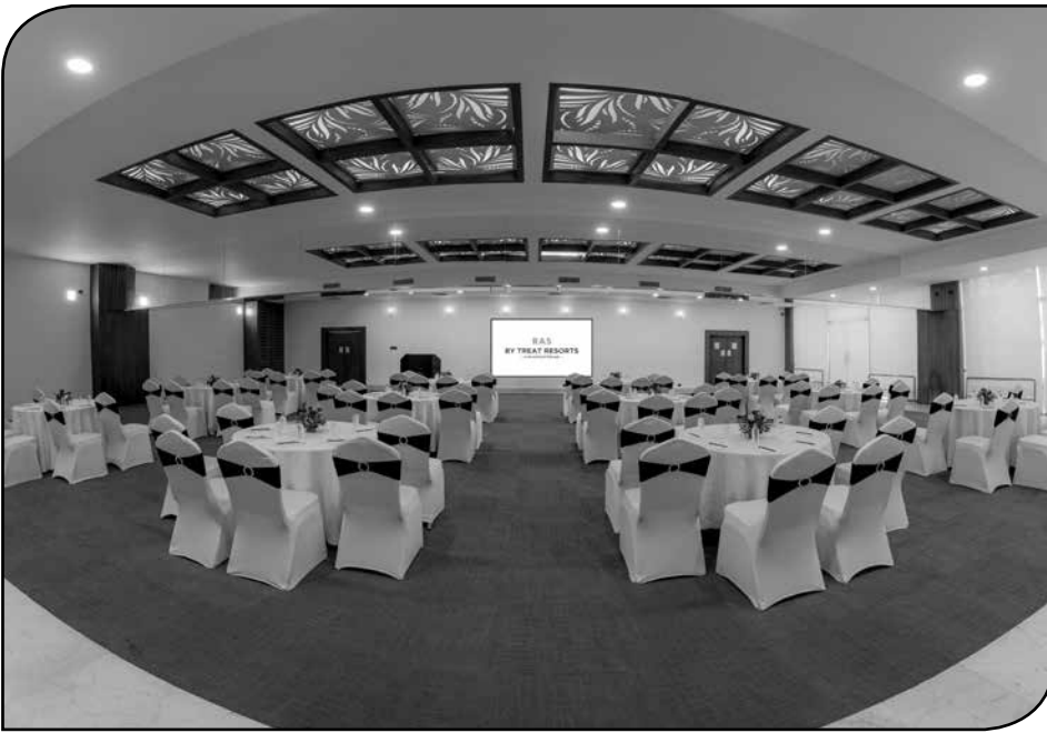
SAMMELAN - BANQUET HALL