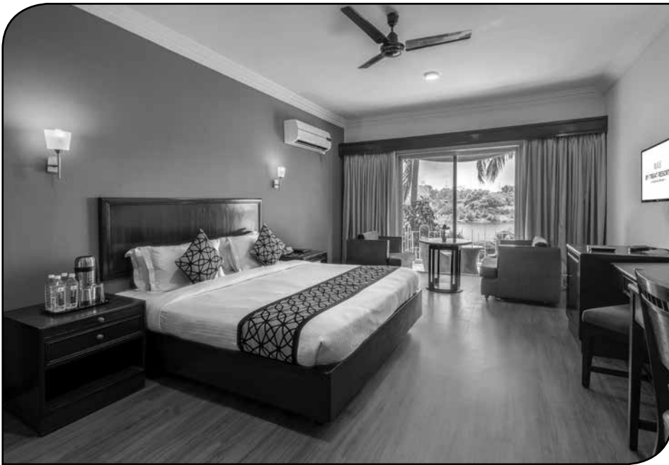
EXECUTIVE ROOM - RIVER VIEW