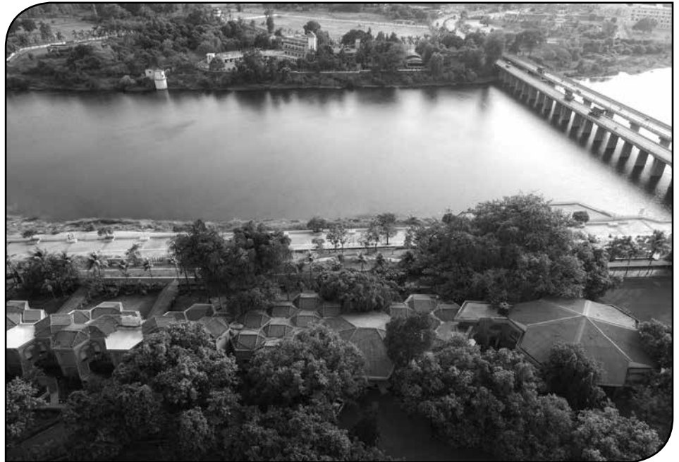
ANOTHER AERIAL VIEW OF RAS BY TREAT