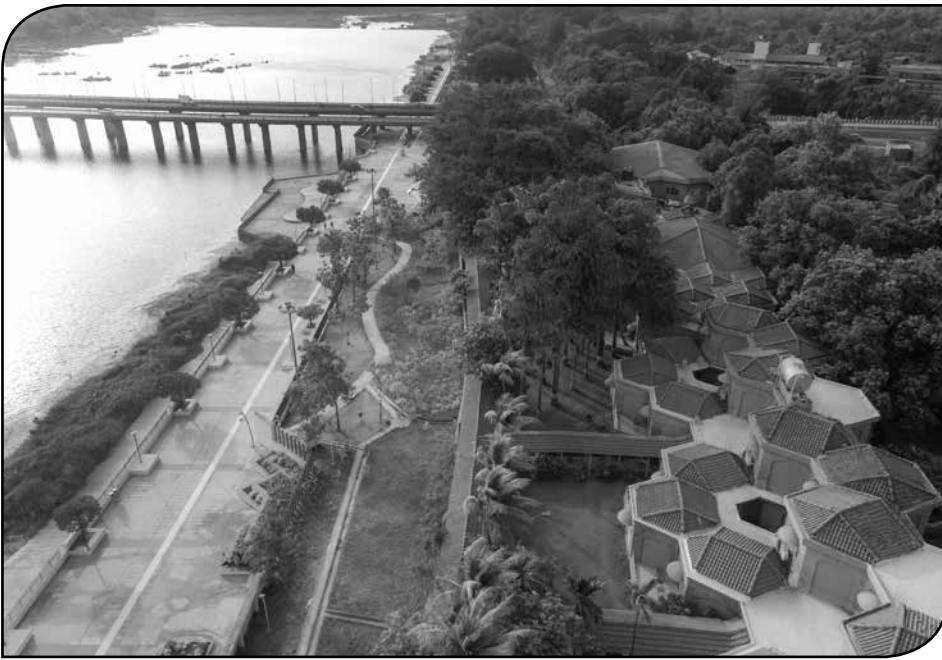
RAS BY TREAT-AERIAL VIEW