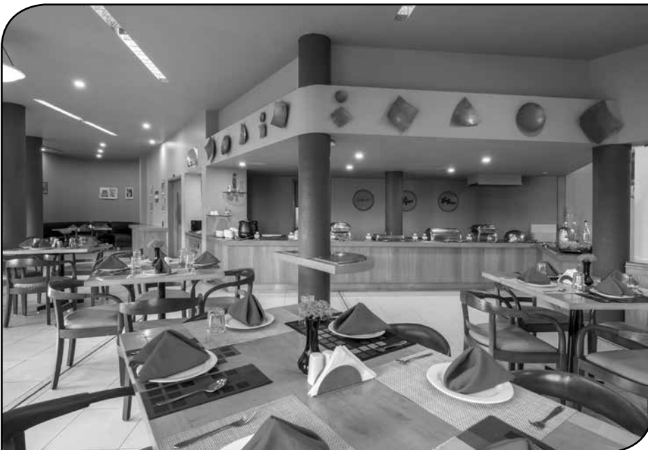
BISTRO THE FEAST VILLAGE