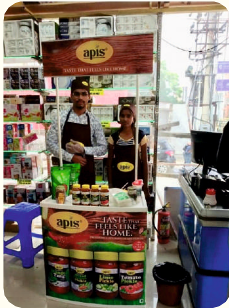
Pickle Launch Activation