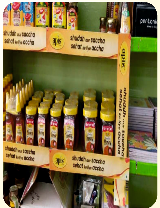
Modern Trade Branding