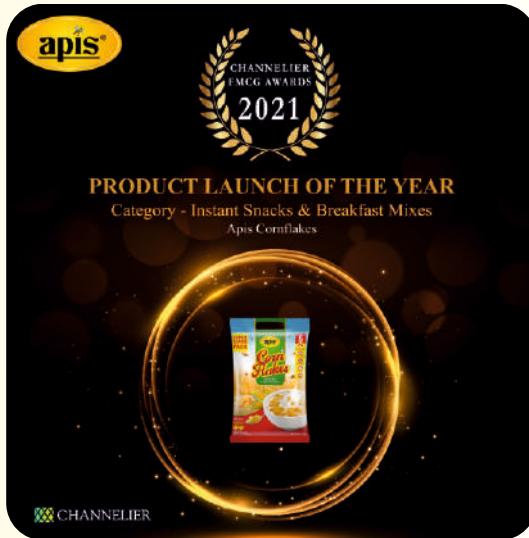
Product Launch of The Year APIS CORNFLAKES