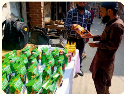
On Ground Market Activity