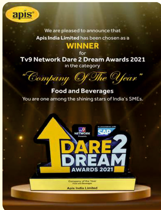
Tv9 Network Dare 2 Dream Awards 2021 in the category COMPANY OF THE YEAR Food and Beverages