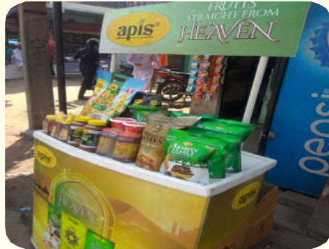
On Ground Market Activity