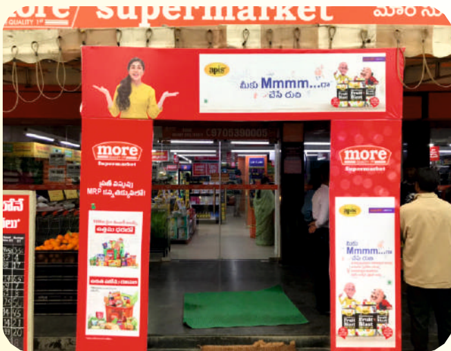
Modern Trade Branding