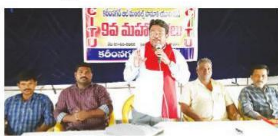
కార్మికులతో వెళ్ళి చాకి చేయించుకున్నాడు తెలిపారు. హమాళీ వెల్ఫేర్ బోర్డు ఏర్పాటు కోసం బహిష్కారం చేసిన హైదరాబాద్ లాంటి ఆంధ్రప్రదేశ్ కార్మికులకు నిర్దేశించిన...