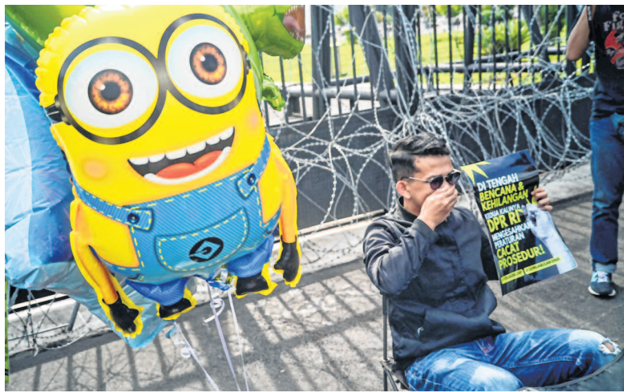
Activists protest against the new criminal code outside Parliament in Jakarta on Tuesday

Rights groups criticised some of the revisions as overly broad or vague and warned that adding them to