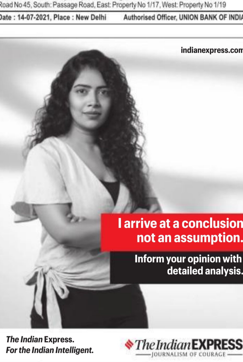
The Indian Express. For the Indian Intelligent.

indianexpress.com Inform your opinion with detailed analysis.