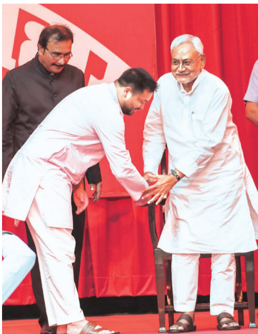
'BJP should be worried for 2024': Nitish Kumar (right), who was sworn in as Bihar chief minister for an eighth time on Wednesday, asserted that the NDA government at the Centre led by Prime Minister Narendra Modi needs to 'worry' about its prospects in the 2024 Lok Sabha polls. Along with Nitish, RJD's Tejashwi Yadav took oath as his deputy