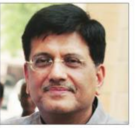
Commerce and industry minister Piyush Goyal