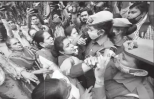
ઉત્તર પ્રદેશમાં મહિલાઓ પર અત્યાચારનું વર્ષી રહેલા પત્રમાં ભવિષ્યમાં રાજાથાસિહને કહ્યું કે પીઓકે ભારતનું છે અને હંમેશા રહેશે.

જિ.એન.એ. પ્રેક્ષક ત્રણ વાર વિચાર લેવાનું સૂચવેલા પાકિસ્તાનના પ્રધાનમંત્રી ઈમરાન હાનિએ રાજાથાસિહને કહ્યું કે પીઓકે ભારતનું છે અને હંમેશા રહેશે. રાજાથાસિહને કહ્યું કે પીઓકે ભારતનું છે અને હંમેશા રહેશે. રાજાથાસિહને કહ્યું કે પીઓકે ભારતનું છે અને હંમેશા રહેશે.