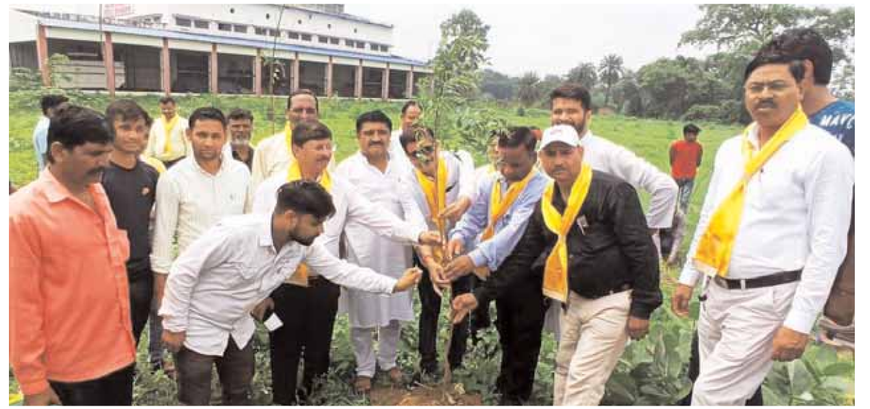
Tree plantation drive being carried out at CSA University on Monday