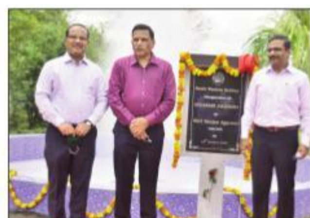
SWR celebrated the 65th Railway week celebrations on October 13, 2020 at Rail Soudha, the Headquarters at Hubballi. The function was unique in the sense that it was organised virtually with the individual

awardees participating through online. The Railway week celebrations are being held award Divisions/Units for their performance during the year and to recognize and award the excellent work done by officers and staff for the excellent work done during the previous year. In the first session a Principal Officers Meeting was convened wherein the Divisional Railway Managers, gave a presentation highlighting their achievements and performance of their divisions which was followed by the Principal Head of the Departments.