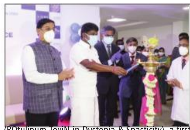
SIMS Hospital (SRM Institutes for Medical Science) one of the leading quaternary care super specialty hospital in Chennai, announced the launch of BONDS,