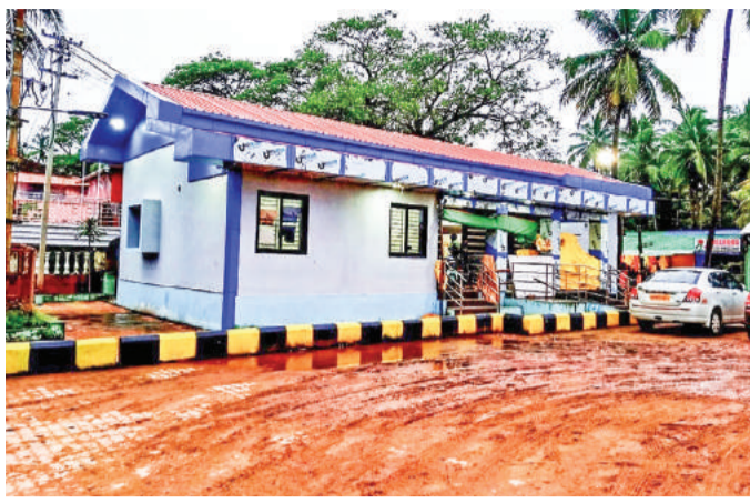
किनाऱ्यावर सुमारे एक कोटीच्या खर्च करून गरज नसताना शौचालय बांधले आहे. किनाऱ्यावर जाणारा रस्ताही अरुंद असल्याने पर्यटकांची गैरसोय होत आहे.

या बदलत्या काळानुसार तशा सुविधा उपलब्ध होण्याची गरज होती पण या ठिकाणातील विजेची कमतरता भरून काढण्यासाठी आणखी दोन ट्रान्सफरची गरज आहे, या ठिकाणी टाकण्यात आलेली जलवाहिनी ही अर्ध्या भागात टाकलेली असल्याने अर्धा भाग पाण्यासाठी आजही तहानलेला आहे. कित्येक वर्षांपूर्वी टाकण्यात आलेल्या वीज वाहिनीच्या तारा अत्यंत कोमेजलेल्या असल्याने त्यावर जरी