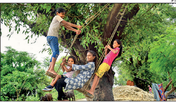
A POSITIVE SWING

The two subregions showing reductions in undernourishment, eastern and southern Asia, are dominated by the two largest economies of the continent—China and India.