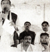
ఉక్కుశాఖ సహాయ మంత్రి

కో ఎయిర్పోర్ట్ నిర్మాణానికి నమంత్రితో మాట్లాడాలని కోసే సర్పంచలు, గిరిజనులు ప్యలతో కూడిన వినతిపత్రం