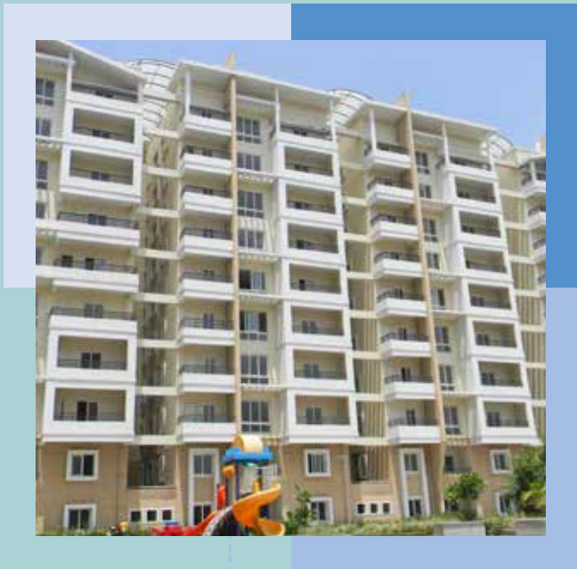
MANJEERA DIAMOND TOWERS