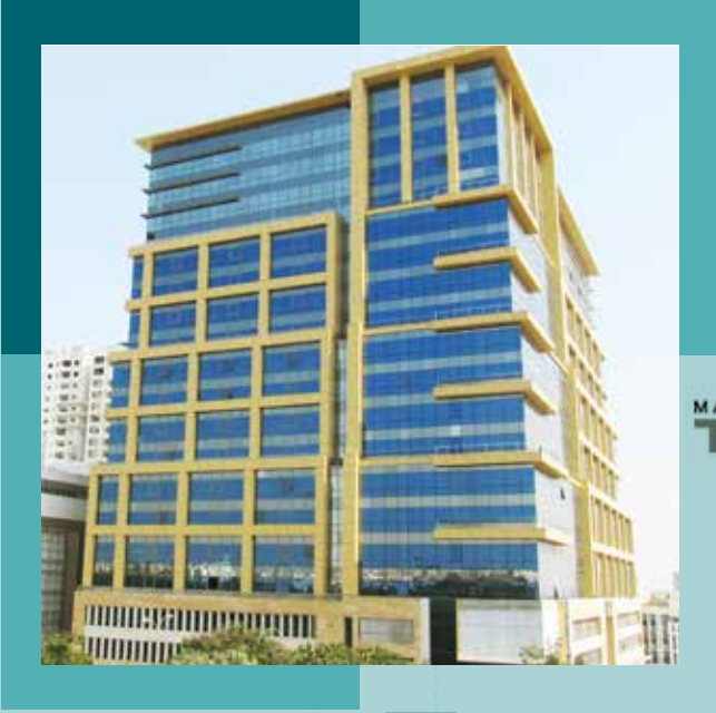
MANJEERA TRINITY CORPORATE