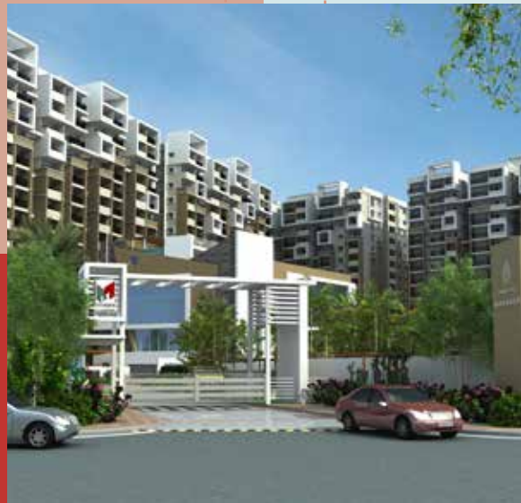
Manjeera Monarch, Vijayawada Project