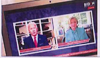
Clinton turned out for women's marches and women ran for office in record numbers, helping Democrats

"I think there's an important role she has to play in saying, 'Oh, she's getting up every morning and doing this work and we can, too.' I think it's an important message that you just got to take yourself off and keep going." After Trump's selection, mil-