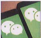
In China, WeChat, or Weixin as it's known, is critical infrastructure — texting, social media, cab-hailing, payments and more, all wrapped into one app.

Many Chinese businesses don't even take credit cards anymore, just WeChat. It has