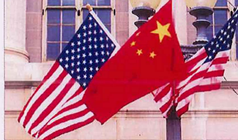
China's imports of US farm and manufactured goods, energy and services are well behind the pace needed to meet a first-year target increase of $77 billion over 2017 purchases. But its purchases have increased as China's economy recovers from a coronavirus lockdown earlier this year. During visits to Arizona and Iowa on Tuesday, Trump expressed frustration about China's handling of the health crisis and its failure to contain the disease, but he also lauded record purchases by Beijing of US farm products.

Meadows said the review, mandated as part of the trade agreement with China, had not been rescheduled, but US Trade Representative Robert Lighthizer ran a regular contact with his counterpart in China about fulfilling its commitments. There are no rescheduled talks — at this point," Meadows told reporters. Ambassador Lighthizer continues to have