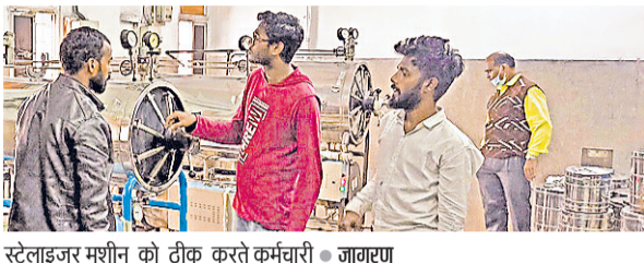
स्ट्रेलाइजर मशीन को ठीक करते कर्मचारी