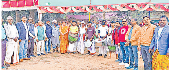
विजेता प्रतिभागियों के साथ अतिथि