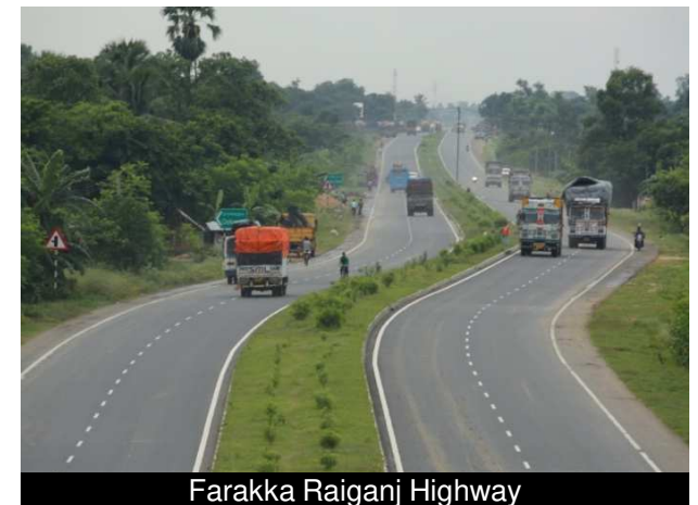
Farakka Raiganj Highway