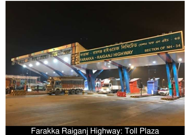
Farakka Raiganj Highway: Toll Plaza